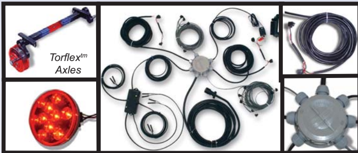
Our wiring system is built for extreme conditions. Standard LED lights